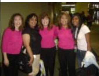
With 3ABN artistes

The smiling faces, caring disposition, initiatives for friendship, were remarkable. There was always someone to talk to, greet with a friendly smile, or to share an experience. I was pleasantly surprised to find many non-Adventists also visiting.