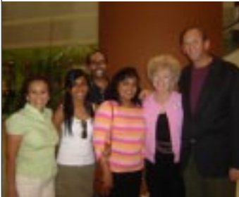
With former members of Balestier Church